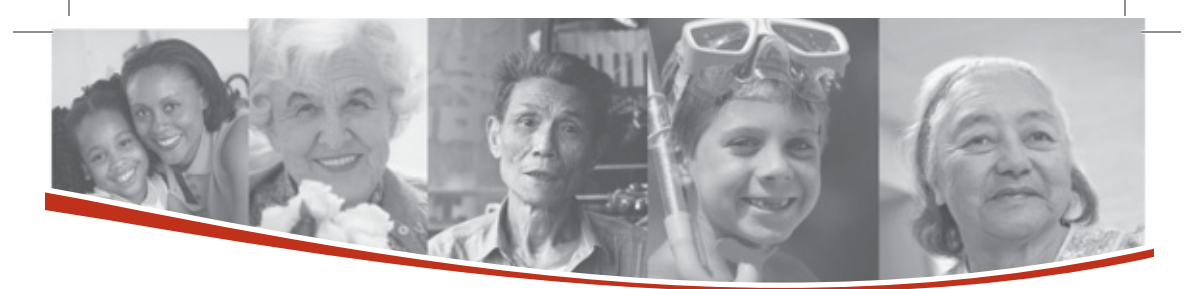
Step 3: Talk about it.

Find someone to talk with about your feelings.